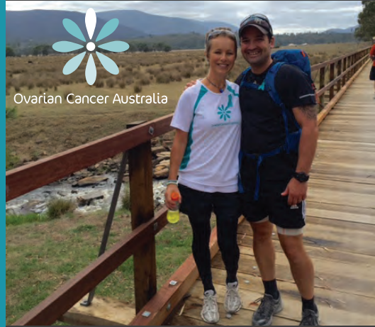
Ovarian Cancer Australia

Help us find an early detection test & Support Gentle Hands Orphanage To register visit: www.walkwithme4oca.com Entry by Donation :)